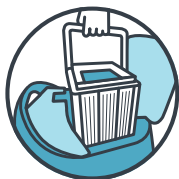
Top load filter basket