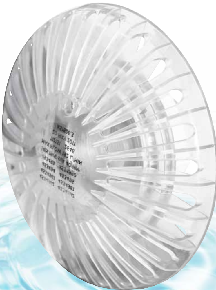
Clear suction fitting fibreglass. Available 40mm & 50mm

The Waterco Fibreglass Pool 50mm & 40mm suction fittings are covered by a 1 year warranty for domestic and commercial installations