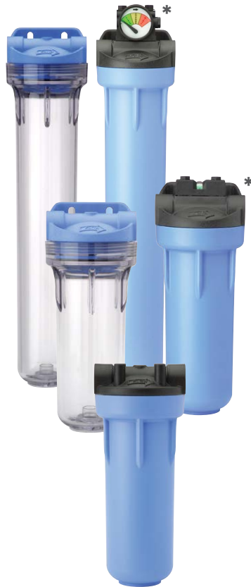
*Shown with differential gauge. Gauges sold separately.

VERSATILE DESIGN ACCEPTS MULTIPLE CARTRIDGE SIZES IN A VARIETY OF APPLICATION SETTINGS