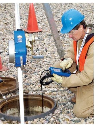
Quickly profile streams and rivers. Easily verify other metering tools or use to select optimal monitoring sites.