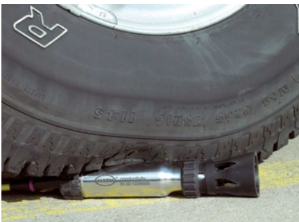
Fig. 2: The outdoor electrode is designed to function under the toughest conditions.