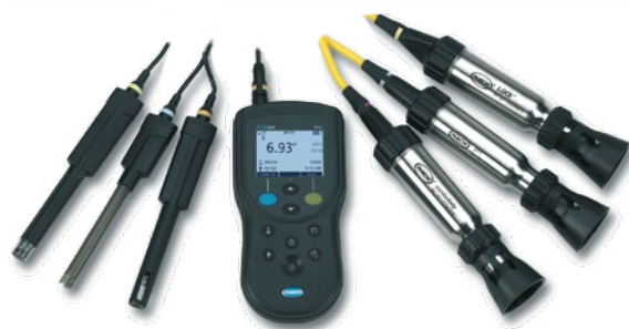
Fig. 3: HQ30D with standard and outdoor electrodes