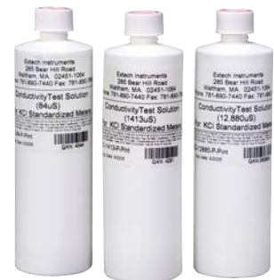
EC-84-P, EC-1413-P, and EC-12880-P pint size conductivity standards