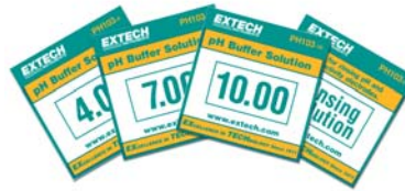
PH103 includes 6 pouches each of pH 4, pH 7, and pH 10 Buffers plus 2 Rinse solutions