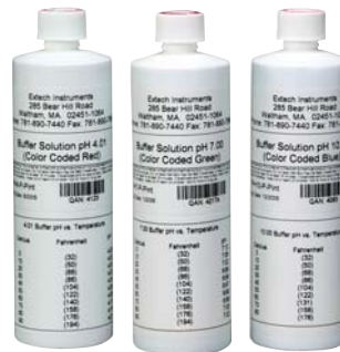
Pint size pH buffers for pH 4, 7, and 10 available (PH4-P, PH7-P, PH10-P)