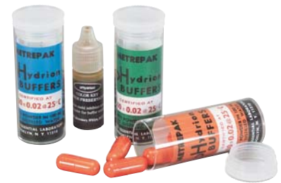
650470 pH 4, 7, and 10 buffer capsules with color key preservative