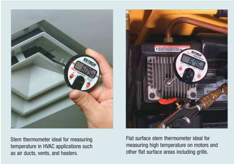
Stem thermometer ideal for measuring temperature in HVAC applications such as air ducts, vents, and heaters.