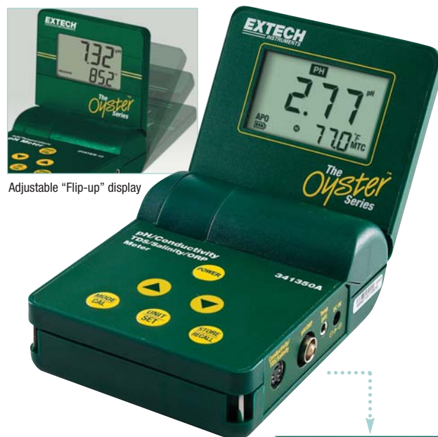
Adjustable “Flip-up” display