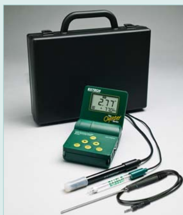
341350A-P kit comes with polymer Conductivity cell, glass pH electrode and Thermistor probe