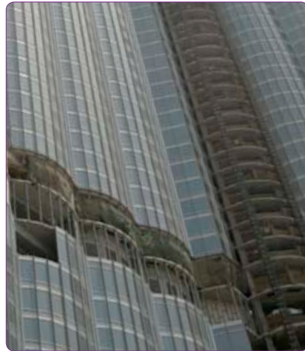
Control MPC is ideal for pressure boosting systems, typically water supply systems which are characterised by varying water consumption

For circulation systems, such as heating or air-conditioning systems, where pump requirements fluctuate and constant differential pressure is essential at a critical point of the system, Control MPC is the answer. You can even set up your system to be controlled according to flow rate or temperature, if required.